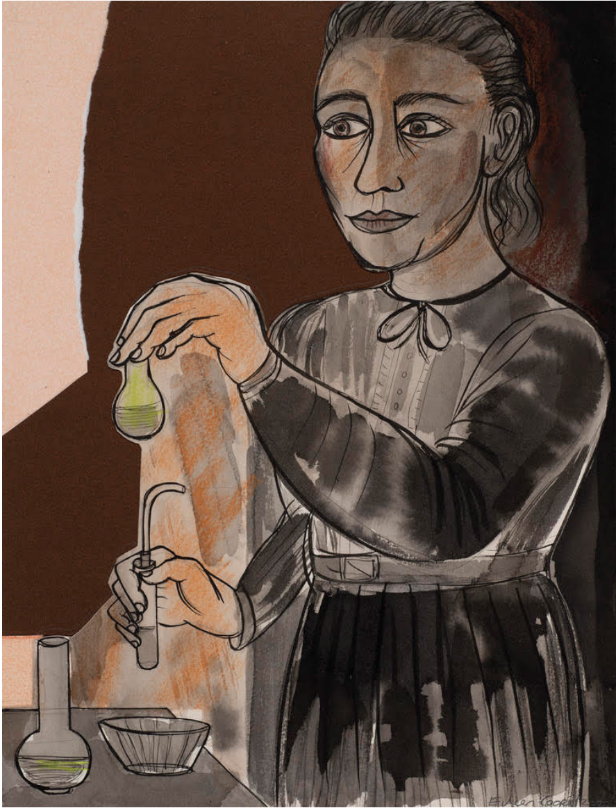
Laboratory, 2022. collage, drawing, ink, pastel and screenprint, 37.5 x 28.5 cm.