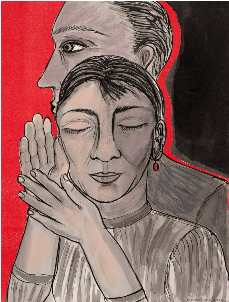
One Day , 2021. collage, drawing, ink, pastel and monprint, 38 x 28 cm.