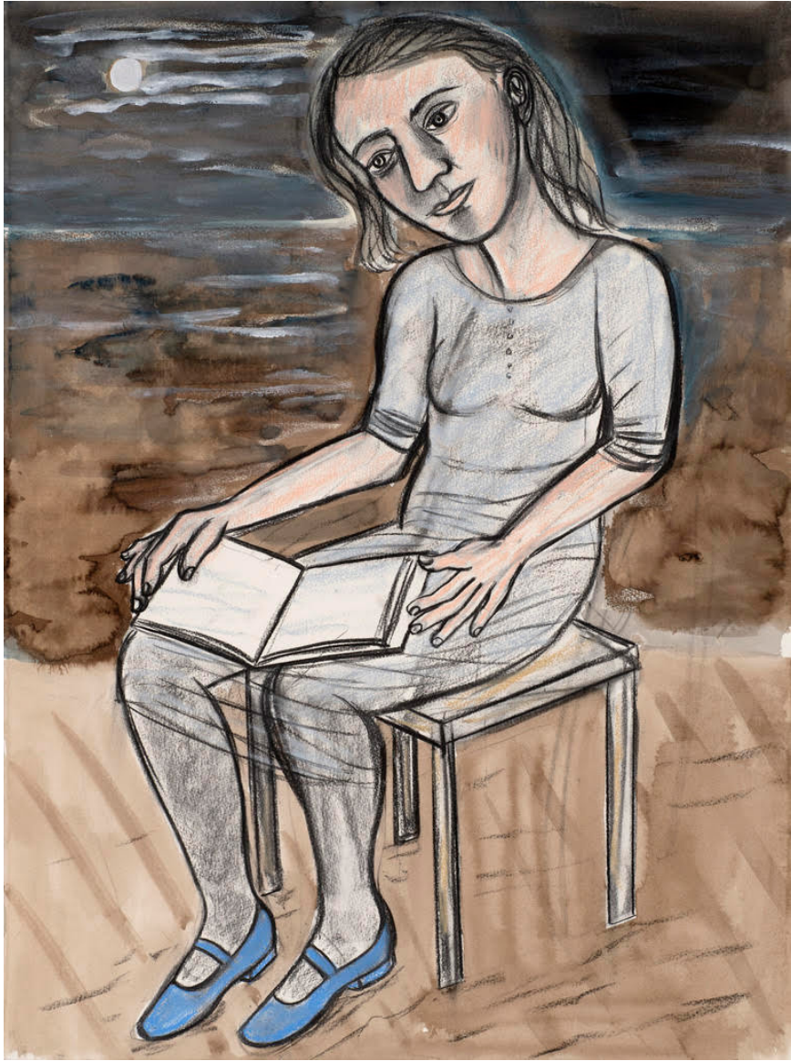
Learning , 2022. charcoal, pastel and gouache, 76 x 56 cm.