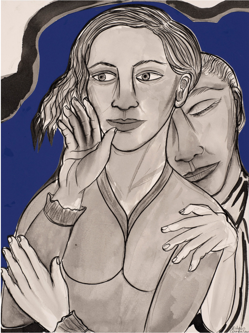
Lover , 2022. collage, drawing, ink and screenprint, 38 x 28.5 cm.