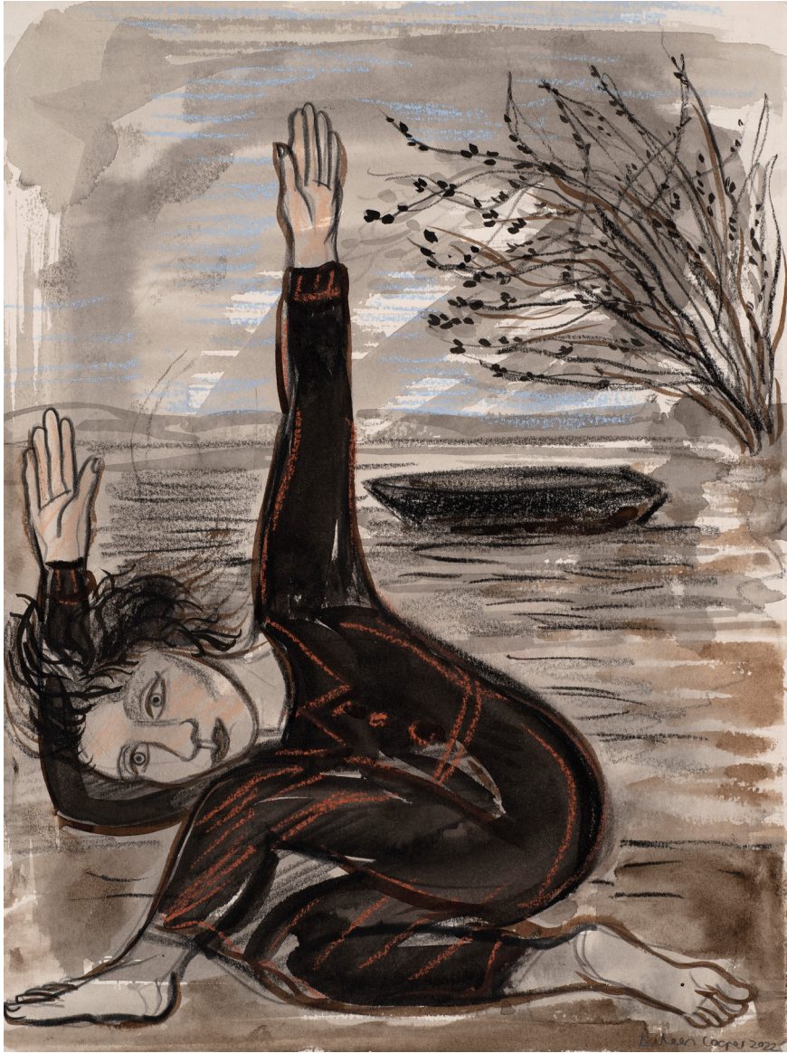
The Long Summers , 2022. collage, drawing, ink, pastel and charcoal, 38.5 x 28.5 cm.