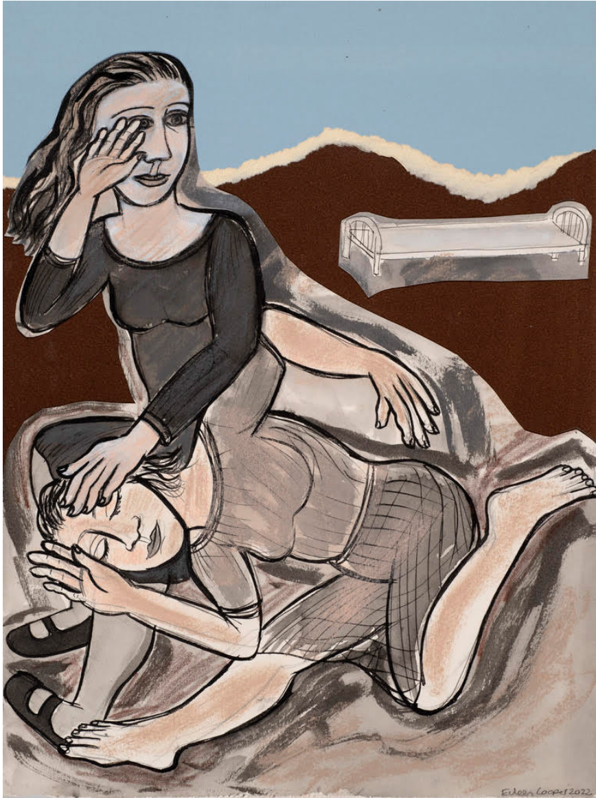
In inity , 2022. collage, drawing, ink, pastel and screenprint, 37.5 x 28 cm.