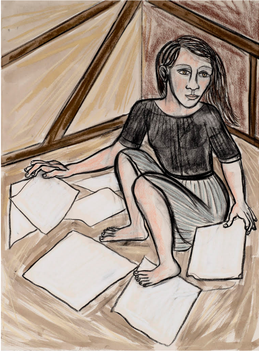
Measuring Time , 2022. charcoal, pastel and gouache, 76 x 56 cm.