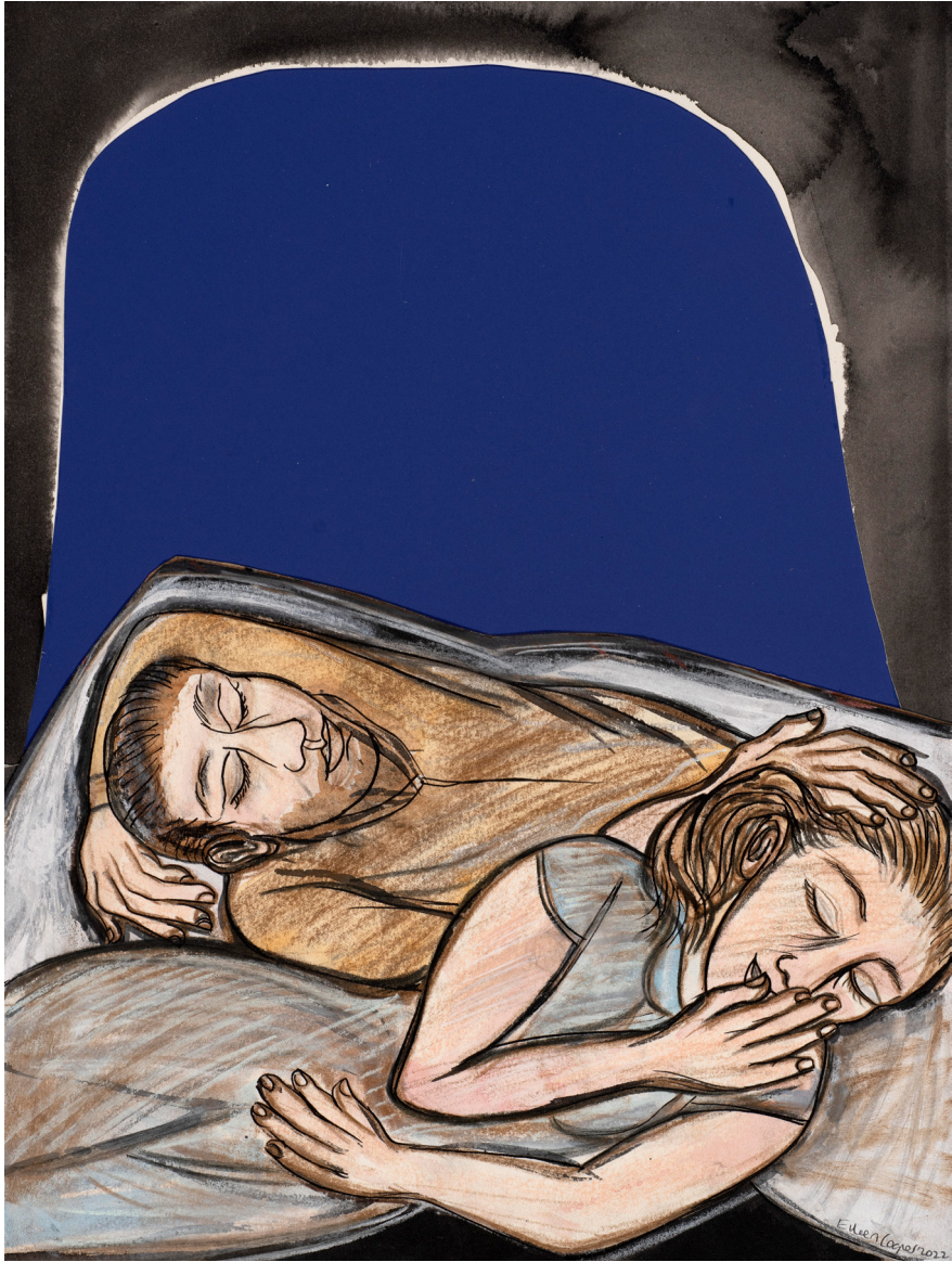
Radium Dreams , 2022. collage, drawing, ink, pastel and screenprint, 38 x 28.5 cm.