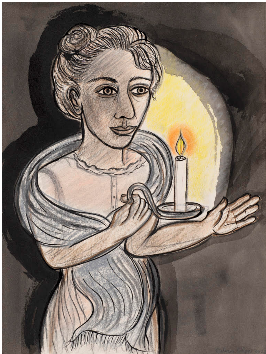
On the Way to Bed , 2022. collage, drawing, ink, pastel and charcoal, 38 x 28.5 cm.