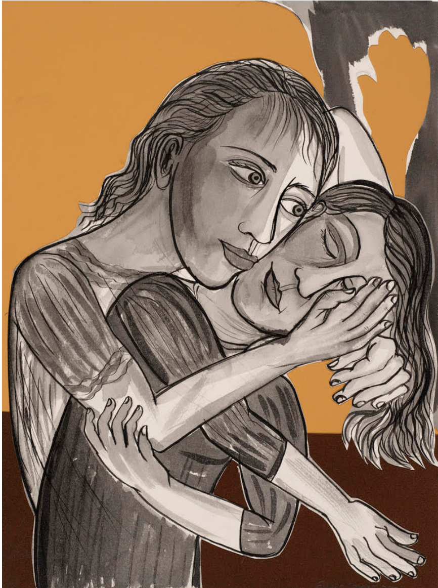
Ghost Girls , 2022. collage, drawing, ink and screenprint, 38 x 28 cm.