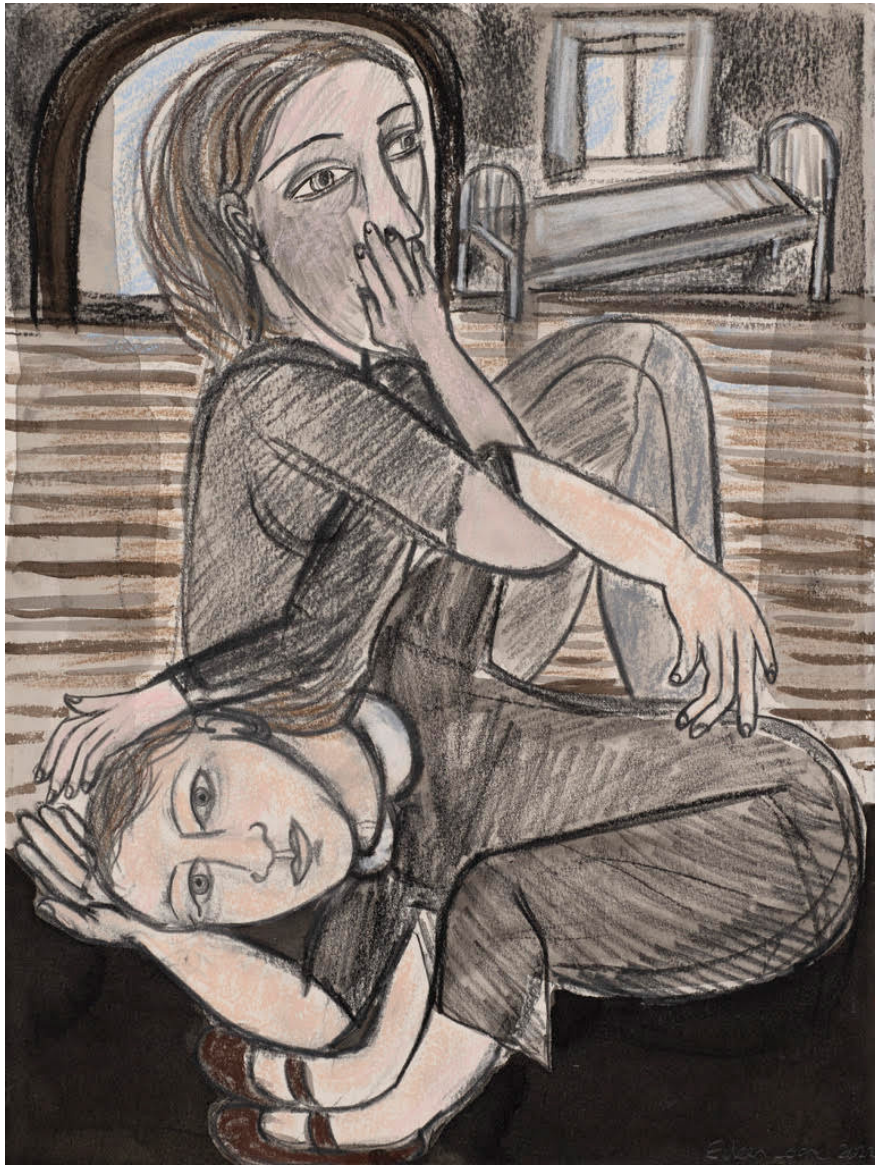
Still Singing , 2022. collage, drawing, ink, pastel, charcoal and graphite, 38 x 28.5 cm.