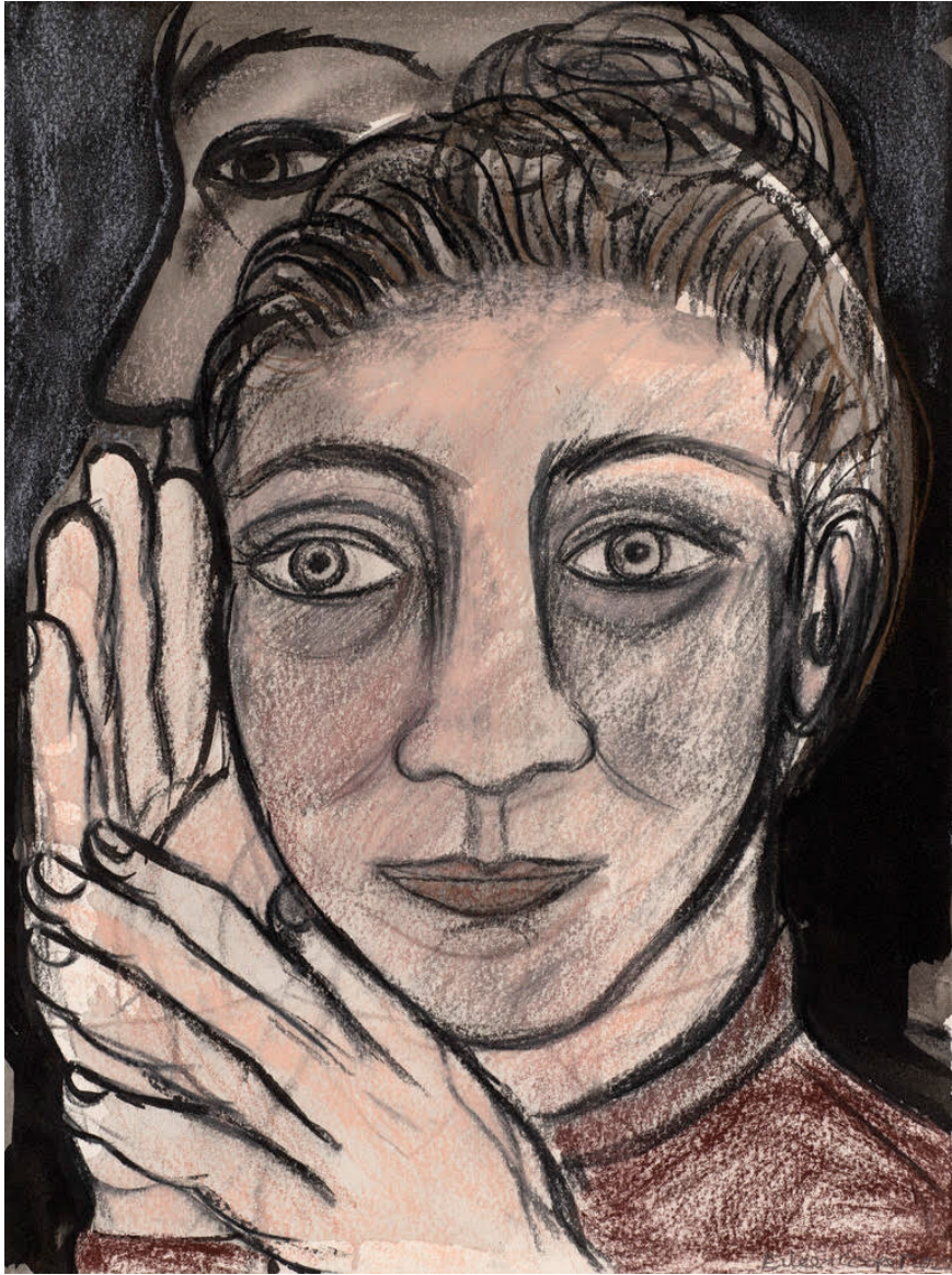
Shared Language , 2022. collage, drawing, ink, pastel and charcoal, 38 x 28.5 cm.