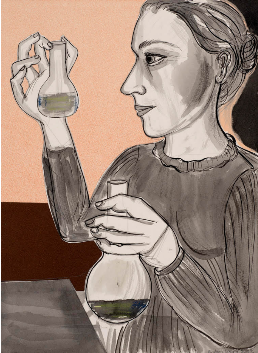
Elements , 2022. collage, drawing, ink and monprint, 38.5 x 28.5 cm.