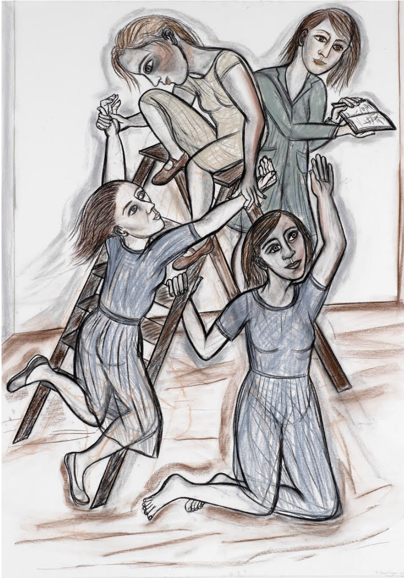
Another Step on the Ladder, 2022. charcoal and pastel, 153 x 107 cm.