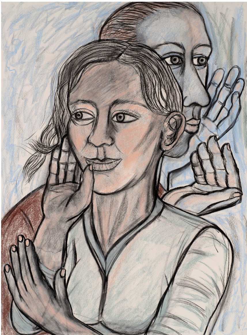
Reading Your Thoughts , 2022. charcoal and pastel, 76 x 56 cm. £4,500 (framed)