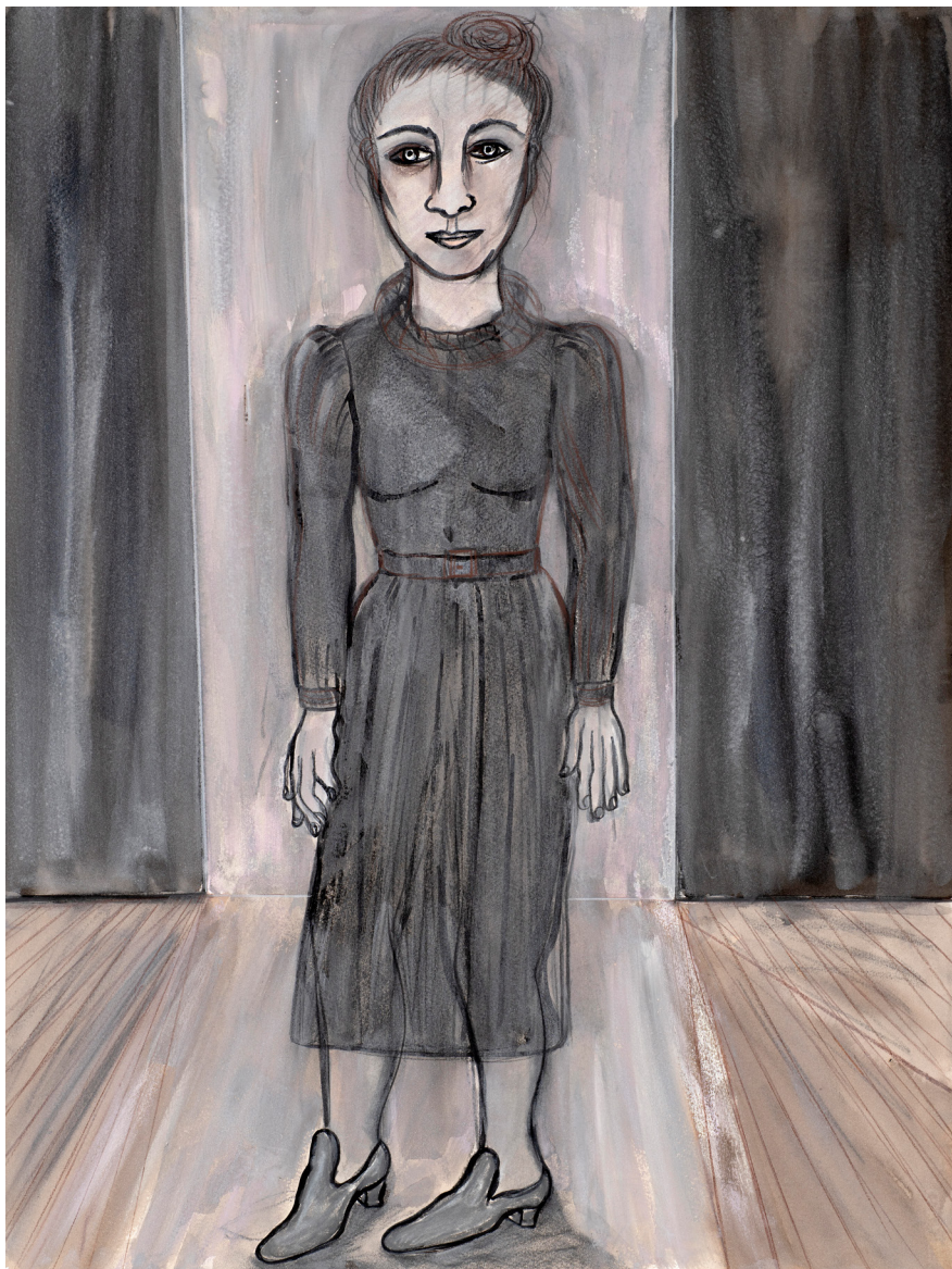
Silent Tribute , 2022. charcoal, pastel and gouache, 76 x 56 cm. £4,500 (framed)