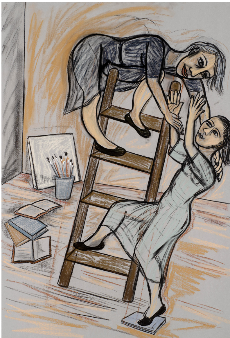
A Helping Hand , 2022. charcoal and pastel, 112 x 107 cm. £7,250 (framed) ●