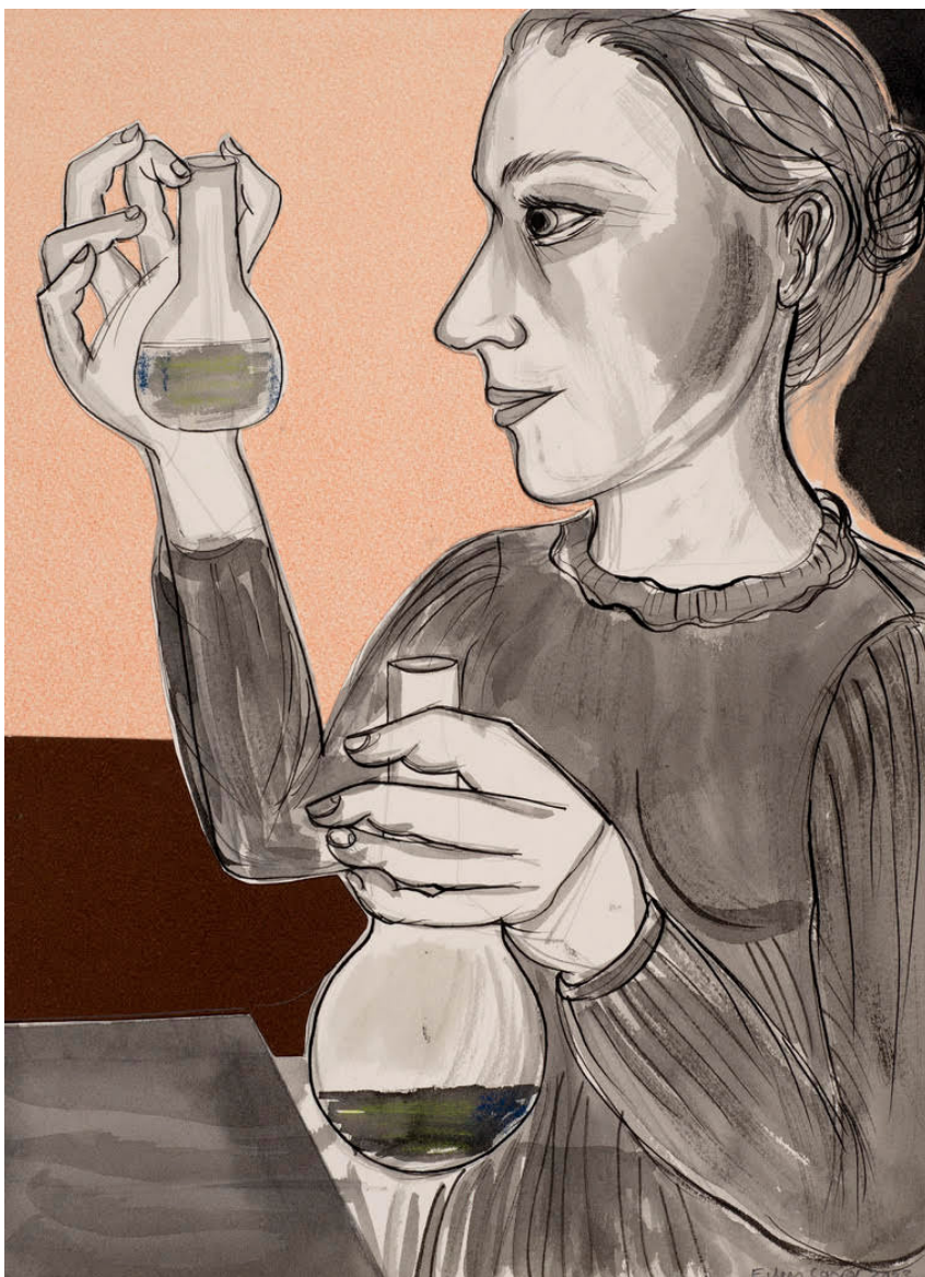
Elements , 2022. collage, drawing, ink and monoprint, 38.5 x 28.5 cm. £1,500 (framed)