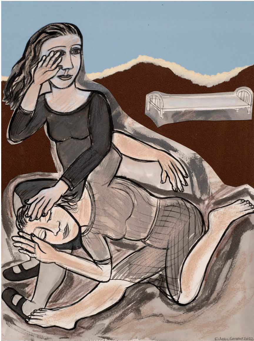
Infinity , 2022. collage, drawing, ink, pastel and screenprint, 37.5 x 28 cm. £1,500 (framed)