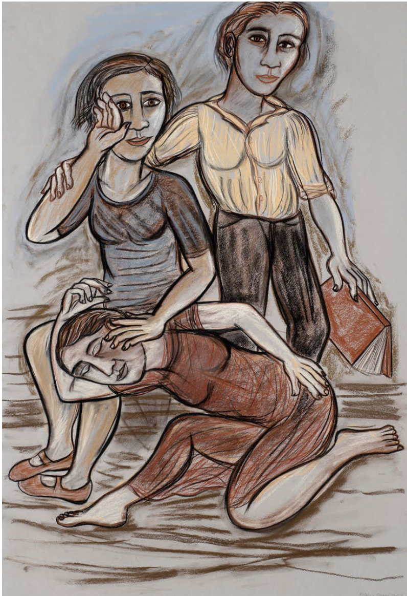
Support System , 2022. charcoal and pastel, 112 x 76 cm. £7,250 (framed)