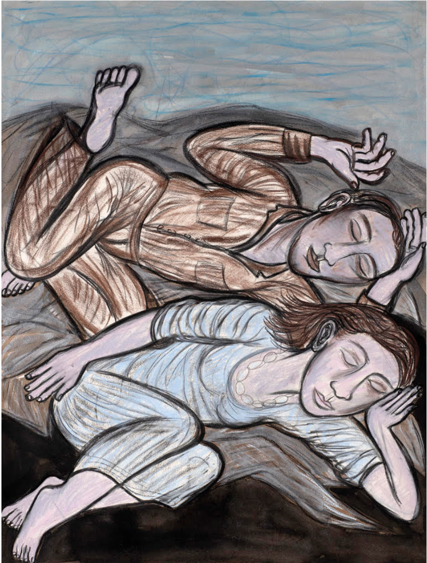
Visible Invisible , 2022. charcoal, pastel and gouache, 76 x 56 cm. £4,500 (framed)